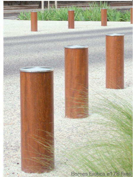
Bornes Exotica ø178 fixes

Bollards made up of a solid machined stainless steel head fixed on a solid turned wood body. PMR model with brushed stainless steel contrast strip. Fully stainless steel removable system, locked by triangular key. Depth of seal 205 mm. Provide a draining layer at the bottom of the reservation for water run-off.